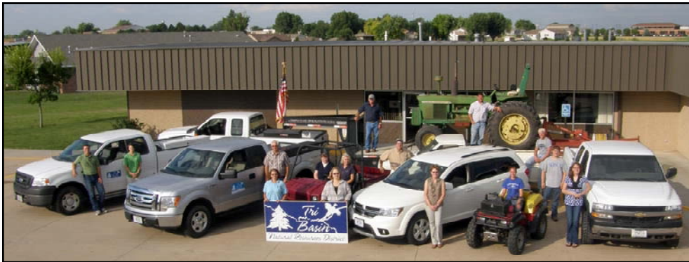
Tri-Basin NRD Staff and Equipment, August 2011

Tri-Basin NRD operates a district-wide Groundwater Management Area to protect groundwater quality and quantity. The NRD has regulated fertilizer application to protect groundwater quality since 1989. District staff have worked cooperatively with farmers and agronomists for more than 20 years to help improve the timeliness, efficiency and effectiveness of fertilizer application. These efforts have resulted in stable or declining nitrate-nitrogen levels in groundwater supplies throughout the district.