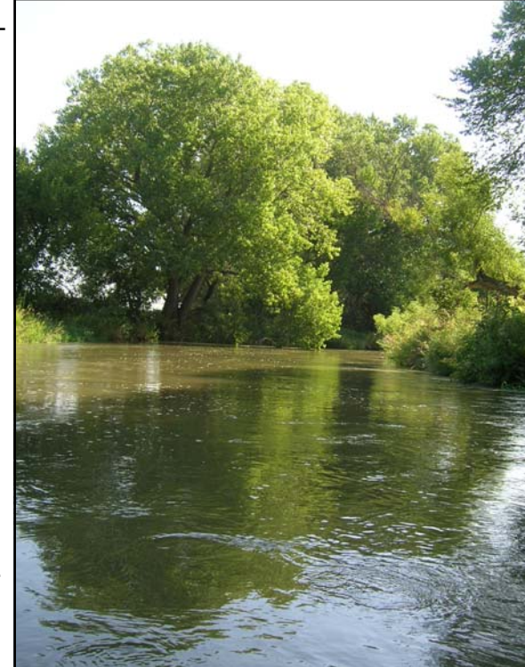
The Republican River, 2012.

That is equal to about 25 percent of Nebraska's alleged overuse in 2005 and 2006, the years for which Nebraska was sued by Kansas. Had the accounting change been in place in 2013, for example, Nebraska would have had to take little or no action to stay in compliance and in 2014 it would have substantially reduced the amount of water pumped by NRD augmentation projects.