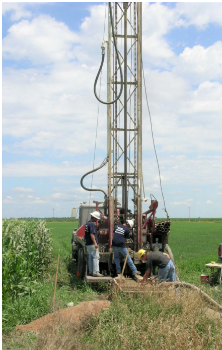
New observation well being drilled in the district.

Tri-Basin's board needs data to make timely and accurate decisions about groundwater management. The district started measuring groundwater levels in 1977, building on groundwater data collected by CNPPID and the University of Nebraska as far back as 1939. We now have a network of more than 200 irrigation wells and 120 dedicated observation wells that are measured at least twice yearly by NRD staff. Most dedicated observation wells also have automated sensors that record groundwater levels twice a day. This vast amount of water level data enables us to create detailed groundwater level change maps like the one shown below. Making sure future generations have an adequate supply of water is an important part of the mission of Tri-Basin NRD. We regularly measure our aquifers in order to track trends in our groundwater supplies. Tri-Basin NRD monitors groundwater levels through an extensive network of dedicated observation wells, with at least one well in each township in the